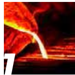
1 Sourcing Suppliers