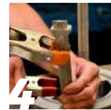
4 Domestic Operations