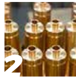
2 Quality Management