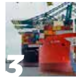
3 Global Logistics