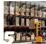
5 Inventory Management